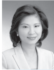
Dr Amy Khor 21 st SISV Council Chairperson on her appointment as Mayor of South West Community Development Council.