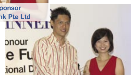
GPS Lands (Singapore) Pte Ltd