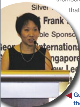
Guest of Honour Ms Grace Fu delights the audience with her speech