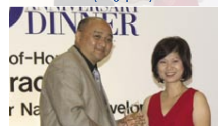
Tiong Seng Constructors Pte Ltd