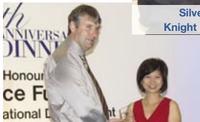
Geometra International Pte Ltd