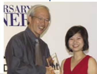
Silver Sponsor Knight Frank Pte Ltd