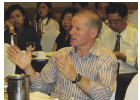
▲ Attentive audience adds depth to the seminar